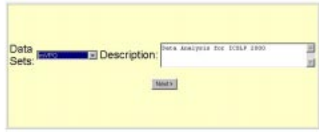
Figure 3. Experimental Design Wizard 1/3. Data Set Creation.

In order to create an experimental design setup, MILER provides a web-based wizard that guides the researcher through three simple setup steps. Figure 3 shows the first wizard page where the user defines the experimental data set name and description.